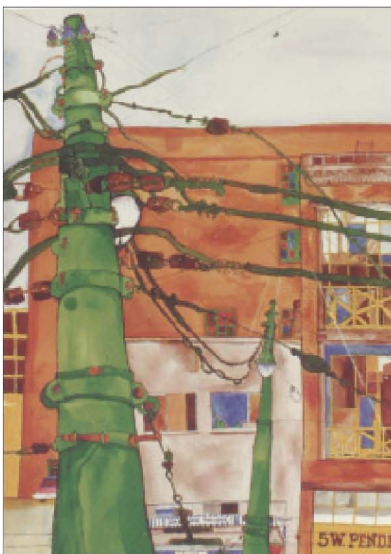
Pender & Carrall Original 22" x 24"