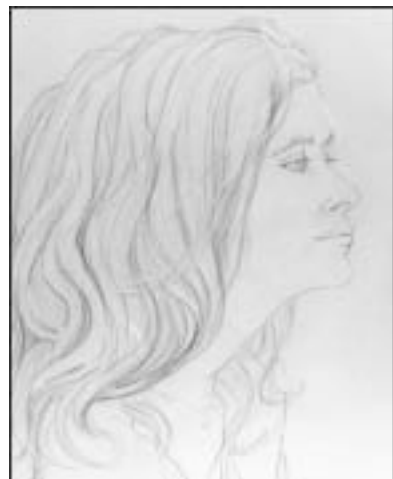
From the Model