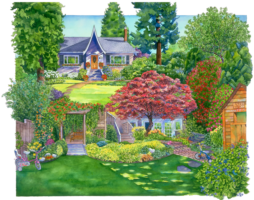
Davis Residence Original 22" x 30"

The Vancouver Sun, cover New Home Section February 1998