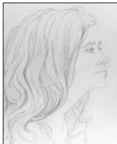
From the Model