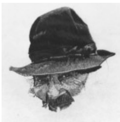
Tonal Drawing Exercise

I show these examples because they are typical of the kind of progress made. I regard drawing technique as a form of literacy as opposed to an endowed talent, and the students are encouraged to use the technical knowledge for personal expression, not as an end in itself. I am an encouraging and playful teacher, and I endeavour to create a warm and safe environment. I find teaching sometimes very exciting and quite often extremely satisfying.