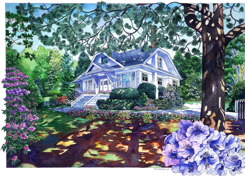
Pena Residence Original 22" x 30"

These paintings are very personalized. I include all the important things in a person's life and their family's. It can include the cat, dog, the favourite plant and flower, the radial arm-saw, the wheelbarrow, whatever your heart desires!